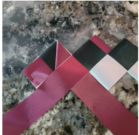
Next, still making sure ribbon is flat, take the end and insert it into the black loop next to the white.