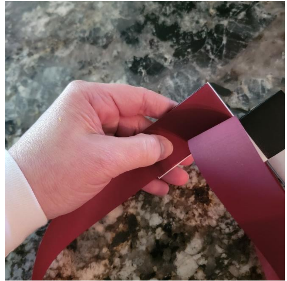
Fold the top ribbon against the black loop and press a crease at the edge with your finger.