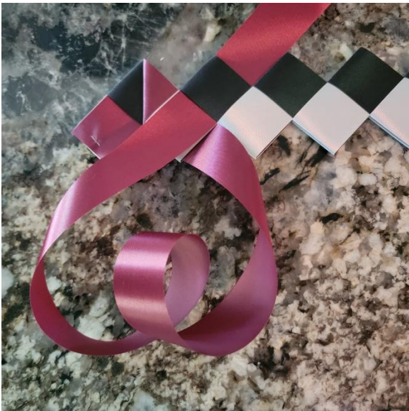
Pull through partially...remember this curl is correct