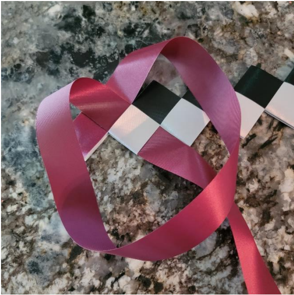
Pull curled loop to the opposite side. This will cause it to straighten out.