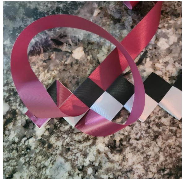
Pull curl to other side, like this.