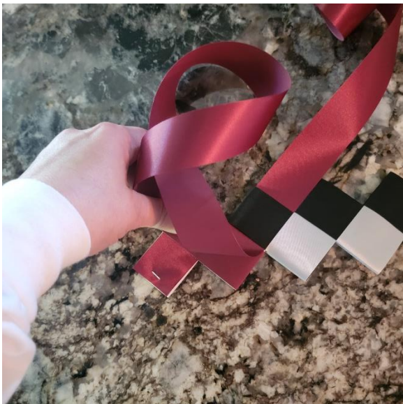
Take the bottom ribbon, pull across the white and black Press with your finger, against the edge.