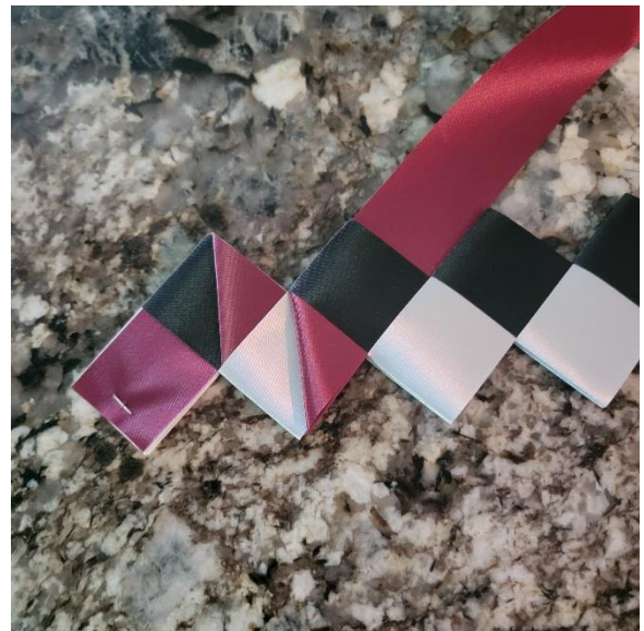
Then pull ribbon through, giving you the second Quilted Diamond.

When you pull your ribbon through and you see the Quilted Diamond...do not pull through too hard, or your Diamond get's wonky! I do press it a little with my fingers, and I make the quilted diamond go down, I like it better hanging that way. ALSO, try using a #5 to make your quilted Diamond for another look!...layering also makes it unique as well! HAVE FUN!